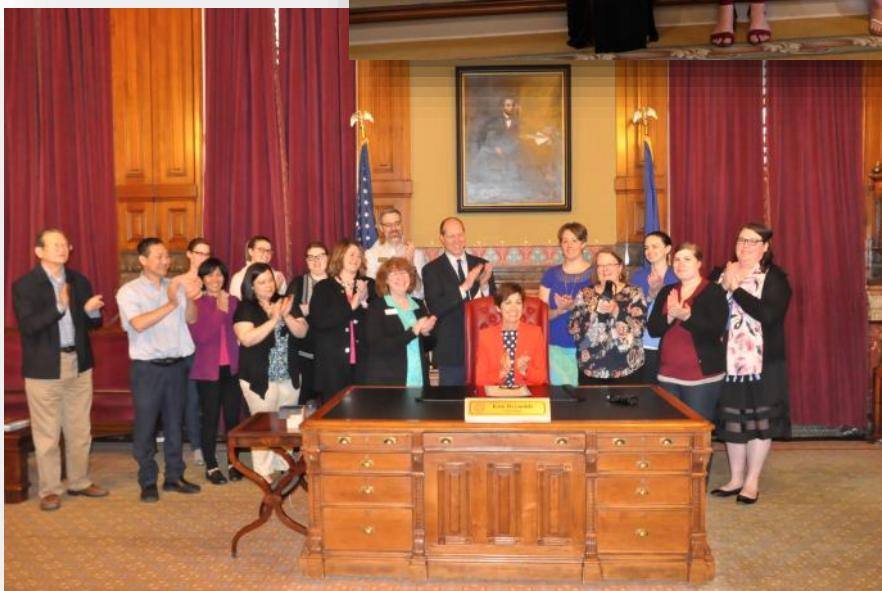
Above: Recent graduates celebrate achieving their certificates in Museum Studies, at the Museum Studies Graduation Ceremony, spring 2018