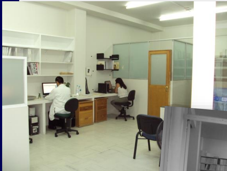
Above and Right: Cuernavaca HPV study site

My forthcoming book, Collective Biologies: Healing Mexican Gender, Race and Family through Medical Research Participation , draws on research based in the Cuernavaca arm of a multinational, longitudinal study of human papillomavirus (HPV) occurrence in men. In this book, I analyze the ways that people's collective rather than individual ideas of biology - based in Mexican cultural understandings of race and society - enabled them to use men's sexual health research participation to further goals outside the clinic. Spouses collaboratively used their research-related experiences to live out self-consciously modern marriage and gender, and to heal bio-social ills on the levels of the couple, family, religious congregation, and Mexican populace, despite economic and narcoviolence crises that threatened these bodies' well-being.