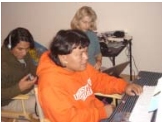
Editing film