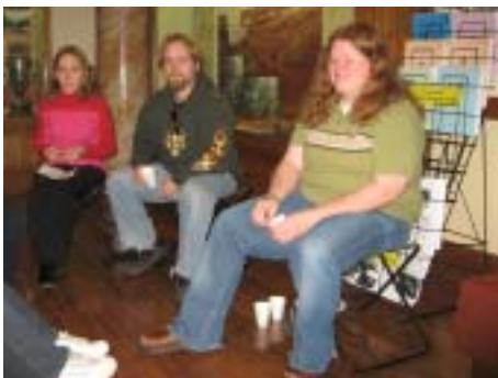
Faculty, staff and graduate students enjoy food and drink in the Natural History Museum, adding to the relaxation that comes with the end of a semester.