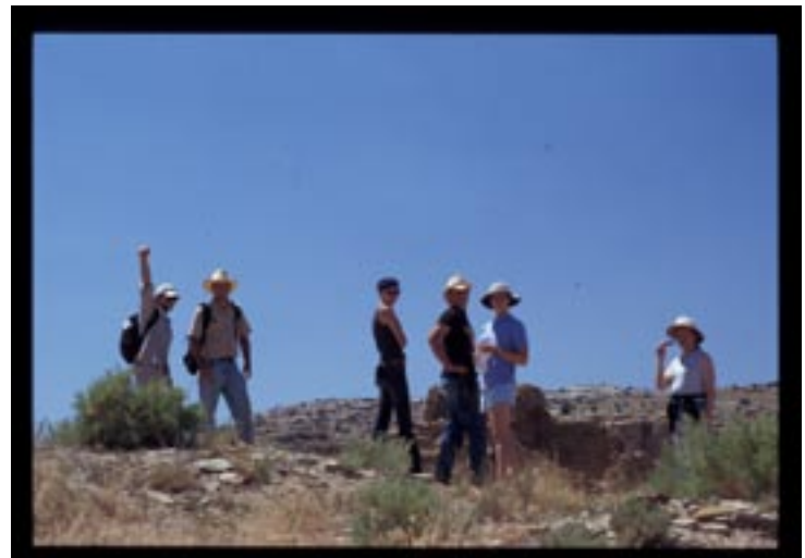
University of Iowa archaeological field school, Central New Mexico, summer 2004.